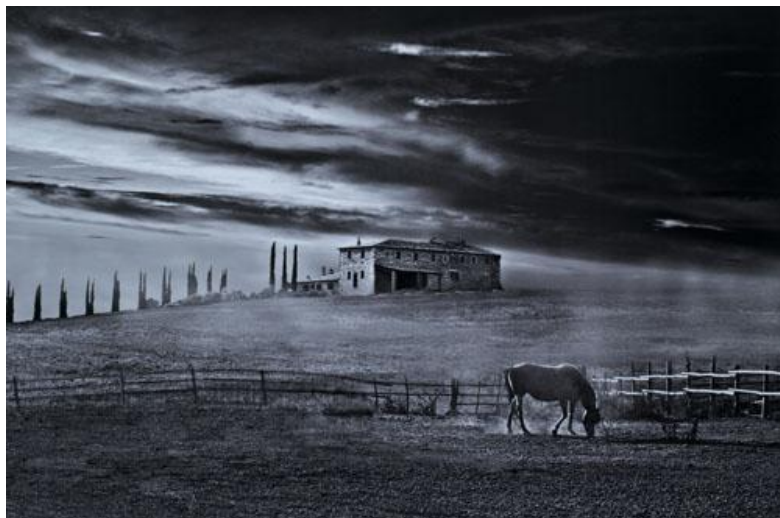
“Verso Sera”, Renato Maffei, Italy Best Print of Landscape