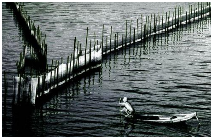
“Fishing net on the river”