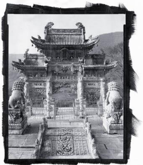
“The white marble torii of Longquan Temple”

The winning images and the best of the rest are shown over the next couple of pages. Copyright is retained by the author